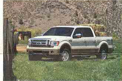
Ford Motor Company